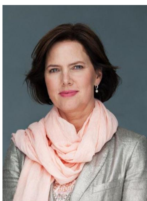
Cora Van Nieuwenhuizen Member of the European Parliament