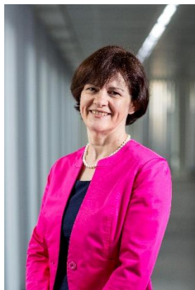
Monique Goyens Director General, BEUC

As Director General of BEUC, Monique represents 43 independent national consumer associations in 31 European countries, acting as a strong consumer voice in Brussels, ensuring that consumer' interests are given weight in the development of policies and raising the visibility and effectiveness of the consumer movement through lobbying EU institutions and media contacts.